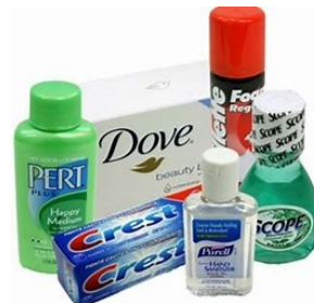
Refugee Family Hygiene Kits is another service project. See the list of items needed on page 4. Full size items are requested.

Be sure to check out the web site for all of the forms, information and latest updates! And watch for the next Canyon Echoes full Convention/Gathering issue in late September.