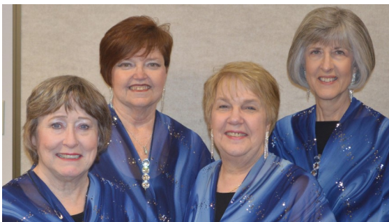
Enjoy the musical sounds of The Breeze, a Sweet Adeline's quartet, at our Saturday night banquet.