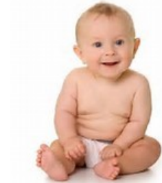
One service project will be the collection of diapers for the Alleluia Diaper Closet.