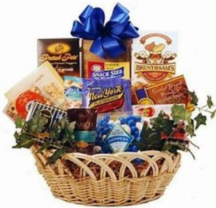
Crafter's Alert: Create a unique gift basket for our Scholarship raffle.