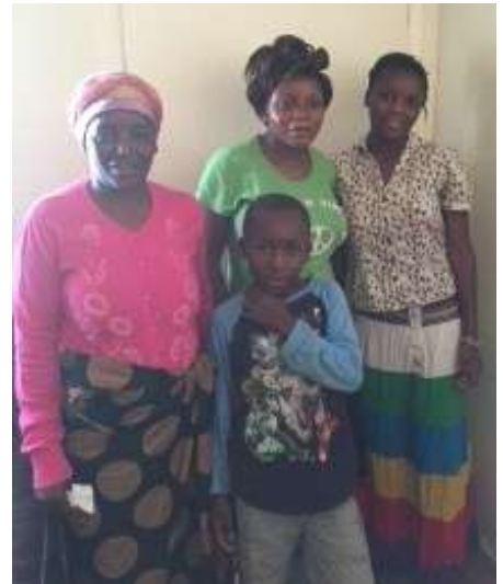
Congolese Refugee Family

Our congregation feels like the rewards have been greater to us than to the family. Being personally involved in helping to resettle a refugee family has made us aware of how blessed we truly are and how easy it is to have a major impact on someone else's life.