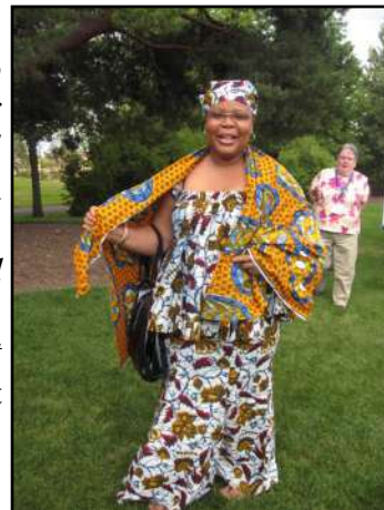
Leymah Gbowee (LAY-mah BO-ee)

Quilters Alert! There is a black and white + one (color) quilt challenge and you don't even have to leave home. Challenge quilts are due in to churchwide by May 17. Go on line for the downloadable fact sheet.