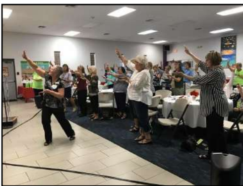
The Art of Moving Prayer experienced at the NE Valley Women's Retreat