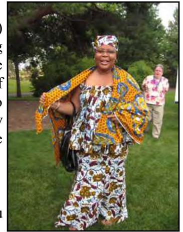
Leymah Gbowee (LAY-mah BO-ee)

Quilters Alert! There is a black and white + one (color) quilt challenge and you don’t even have to leave home. Challenge quilts are due in to churchwide Women of the ELCA by May 17. Go on line for the downloadable fact sheet.